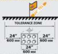
Pipe or multiple ducts of a known size.