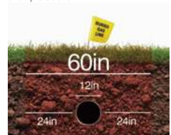
The full tolerance zone is 60" in the example above.