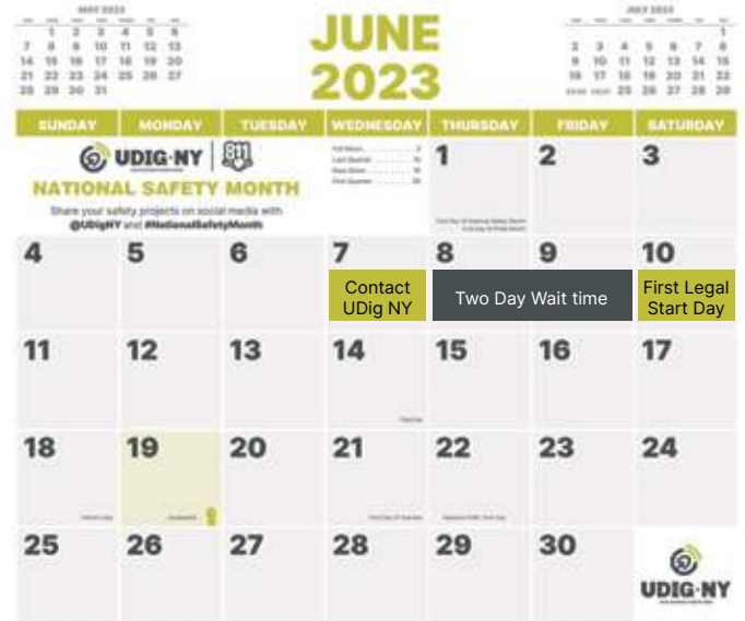
Call and wait time example for digging projects, more examples on page 6