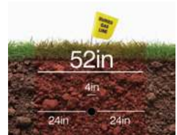
The full tolerance zone is 52" in the example above.