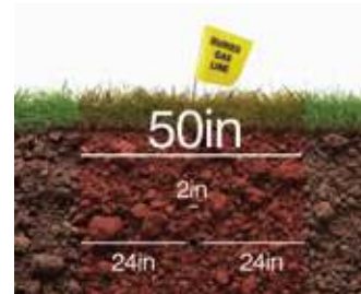
The full tolerance zone is 50" in the example above.

To ensure safety near marked lines, please respect the tolerance zone by hand digging.