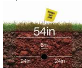
The full tolerance zone is 54" in the example above.